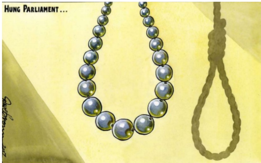
Cartoon B by Gerald Scarfe, Sunday Times 6