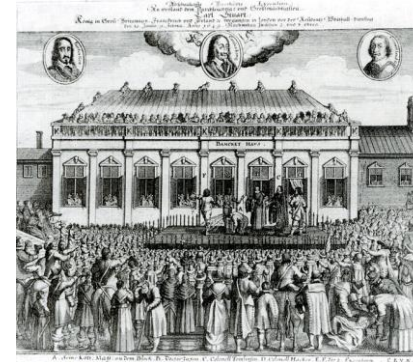
The execution of King Charles I