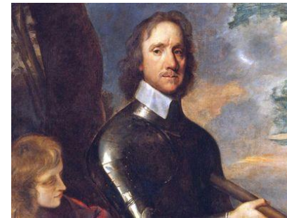
Oliver Cromwell, the Lord Protector