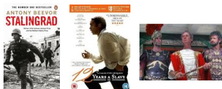
Books Films TV shows

An interpretation is a historian's view of an event. They have usually conducted lots of research and used evidence to form their opinions.