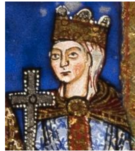
1102 – 1167 Empress Matilda, also known as Empress Maud, was one of the claimants to the English throne during the civil war known as the Anarchy.