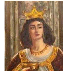
1131 -1152. Melisende was the first female ruler of the Kingdom of Jerusalem.