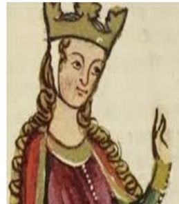
1122 - 1204 Eleanor of Aquitaine was Duchess of Aquitaine from 1137 to 1204, Queen of France from 1137 to 1152 as the wife of King Louis VII, and Queen of England from 1154 to 1189 as the wife of King Henry II.