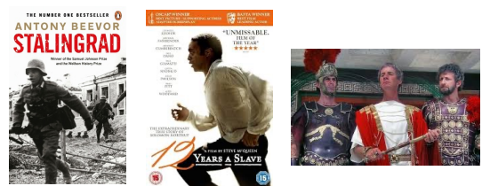
Books Films TV shows

Historical interpretations are made after an event, by people who were not present. An interpretation is a historian's view of an event. They have usually conducted lots of research and used evidence to form their opinions.