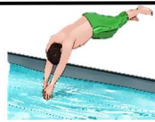
12 min cooper swim