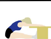
Sit & reach