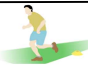
12 min cooper run