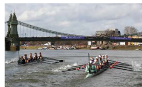
Long distance rowing