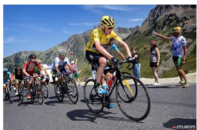
Long distance cycling