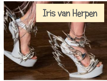
Iris van Herpen