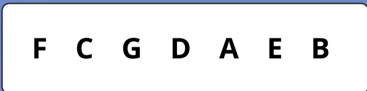
← order of flats